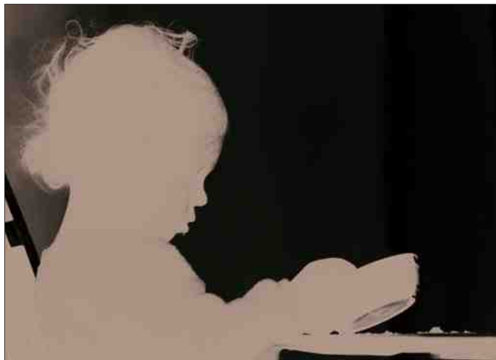
New research shows that millions of people in the U.S. didn't have enough food last year. Regional data show that while many people are applying for food stamps, thousands don't get them.