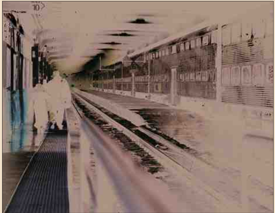
Commuters who ride passenger trains such as the Metra and Amtrak are exposed to “really extreme levels” of unhealthy particulate matter.