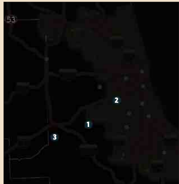
Note: Union Pacific’s Global III rail yard and Burlington Northern Santa Fe’s Logistics Park are not shown on the map.

More than 57,000 people—a majority of them minority—reside within a half mile of the Chicago area’s 15 biggest “intermodal” rail yards. On average, each yard emitted 11 tons of particulate matter annually.